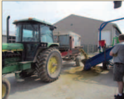
► After mixing, the treated forage is stored in a silage bag.