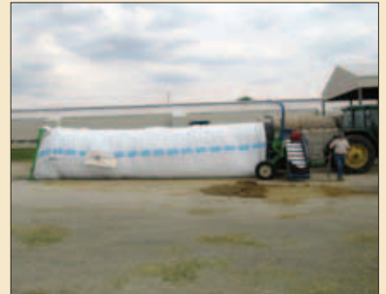
► After sealing the bag, the treatment is allowed to cure for a minimum of seven days.