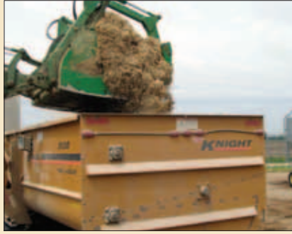
► Field-chopped or ground stover or straw is treated with calcium oxide powder.