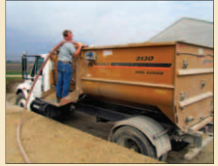
► Water is added to achieve 50% moisture content.